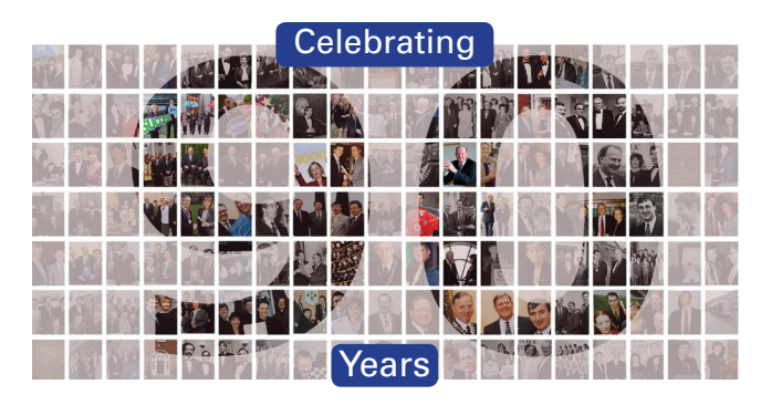
CPA Ireland: 90 Years Accounting for Business